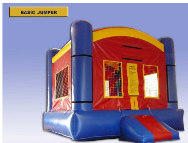
Proposed Jump House