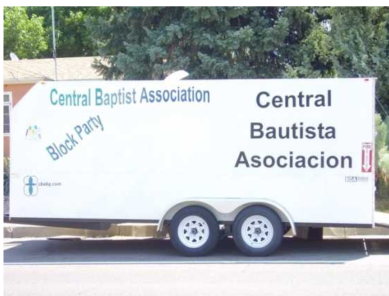
Block Party Trailer

If your church or an individual would like to make a donation toward those purchases, it would accelerate getting the unit up to full speed. Please call Carl Russell at Central Baptist Association, 243-2707, to make a donation or for more information. To schedule the use of the Evangelistic Block Party Trailer please call Kevin Branham at the same number.